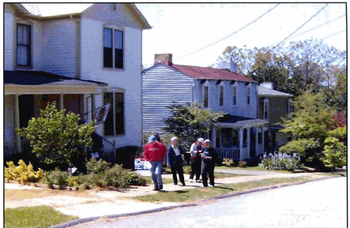
Visitors touring open houses in the 1300 block of Madison St.