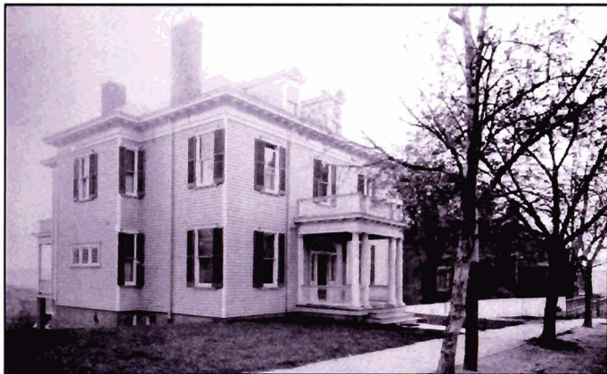
View of 401 Washington Street as it appeared about 1903. Note the original balustrade over the front portico of this new house.