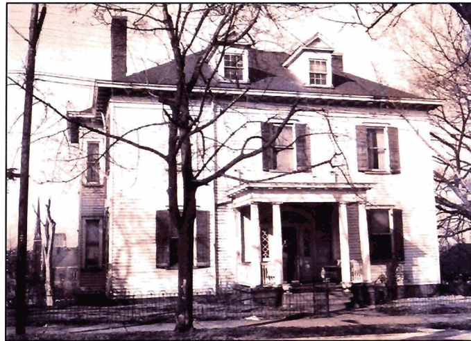
By 1969 the house had lost its balustrade.