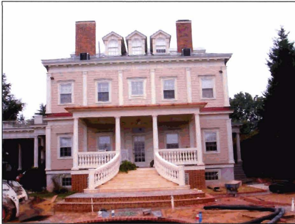
New rear facade and portico at 400 Washington Street