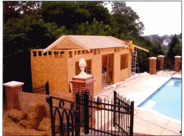
New pool and pool house at 400 Washington Street